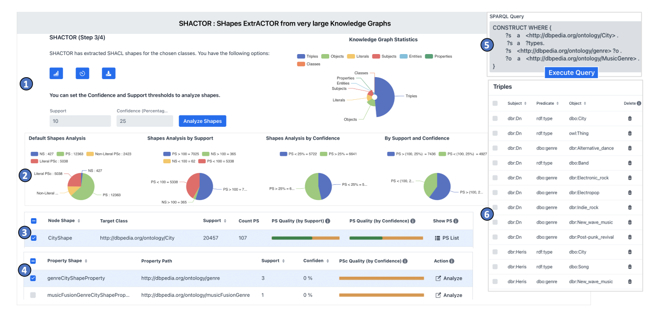
Figure 3: Portions of SHACTOR GUI showing a sample of the analysis of the shapes for DBpedia

shapes can also be downloaded before or after applying pruning thresholds to be used with a shape validation tool.