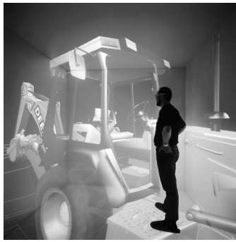
Figure 1: The six-sided cave

number of virtual reality applications ranging from industrial design and simulation to interactive games and virtual reality art. The interaction techniques were tested in random order.