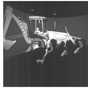
Figure 2: The panoramic display

Six test users participated in the experiment. The test users were all experienced with virtual reality but had no particular experience with the specific applications. The tasks to be performed by the test users primarily addressed orientating and moving in the virtual 3D spaces of the applications as well as selecting and manipulating 3D objects. The test sessions lasted approx. 10 to 15 minutes pr. interaction technique. Data was collected through qualitative observations of use and statements by the test users noted during and after the test. The test users were asked to describe their experience with the interaction technique: was it hard to learn? Was it hard to operate? Did it cause any problems? Did it limit any part of the interaction? Some statements led to the immediate development and test of further interaction techniques.