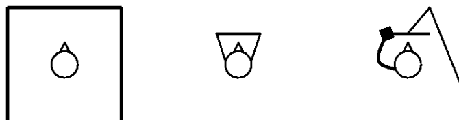
Figure 3: Full immersive displays for virtual reality: six-sided caves, hmds and booms (hmd mounted on stand and operated by hand)

Full and partial immersion in virtual reality are fundamental different user experiences: partial immersion supports the feeling of “looking at” a virtual environment while full immersion supports the feeling of “being in” that environment (Schneiderman 1998:221-222). The potentials for immersing the user in a virtual environment is often measured from the field of view (fov), which describes how much of the user’s view can be covered. This suggests that e.g. panoramic displays are more immersive than head-mounted displays. However, as the fov is measured from a fixed position in a fixed direction and users interacting in a virtual environment are typically not remaining still, other properties should also be considered.