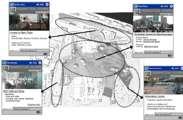
Figure 2. Four location districts and corresponding screens.

The information pushed to the mobile device is tailored to information needs within a specific district. When a user moves into a new district, their context changes, and so does the information that appears on the screen of their mobile device. As the user enters a district, an interactive photorealistic depiction augmented with textual and symbolic information pertinent to that district is pushed to their device. To allow the user to align the information on their display to their physical surroundings, the initial screen displays the corresponding landmark for that district. From this starting point, the user can alter the current perspective and select linked information.