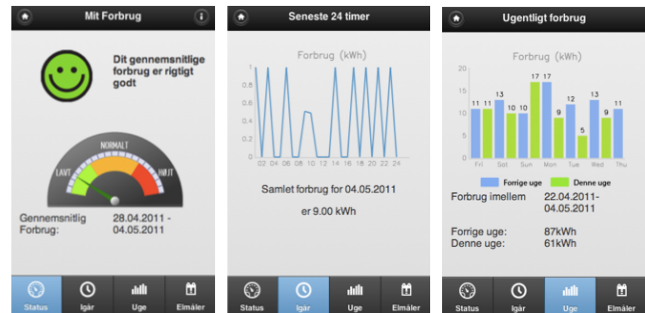
Figure 2. Three views on power consumption namely last week (injunctive), last week consumption (descriptive), and last week compared to the week before (descriptive).

The first view visualizes the total household power usage (measured as kilowatt hour) for the last week compared to the average consumption rate for a similar household in the northern part of Denmark (figure 2, left). The assessment shows whether their consumption is low, average, or high and the inclusion of a smiley supports the assessment – as suggested by [18]. The second view shows household consumption over the last 24 hours (with one measurement every hour). This is visualized as a graph (see figure 2, middle). The third view shows consumption per day for the last week compared to the week before (inspired by [22] and shown in figure 2, right). The fourth view (not shown in figure 2) displays the last meter reading. Thus, Power Advisor seeks to provide different kinds of information for assessing one's own power consumption.