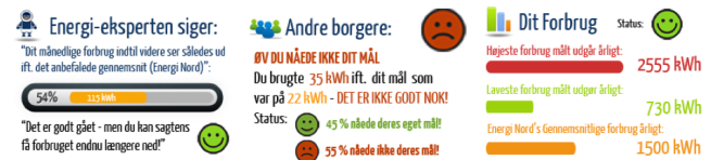
Figure 3. Messages in Power Advisor.

Power Advisor integrates personalized information for the user through a messaging service. All messages are placed in the Inbox and we use three different types of persuasive messages– (i) expert advice, (ii) community behaviour, and (iii) personal consumption performance.