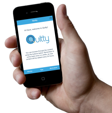
Figure 1: Quitty : smoking cessation application

A prime example of an issue that needs to be tackled in terms of changing health behavior is the continued prevalence of cigarette smoking. Smoking can cause cancer, lung disease (COPD), heart disease and poor blood circulation to mention a few of the many health risks [27]. Nearly six million people worldwide die each year from smoking related diseases, due to their intake of chemicals that exist in cigarettes [35]. Besides the health risks, the issue also has an impact on the economy within social welfare and health systems, in terms of treatment of people afflicted with smoking related illness [28]. In response to these problems, an increasing number of anti-smoking organizations worldwide are investing money and effort to reduce the number of smokers, both in terms of preventing people from starting and making people quit.