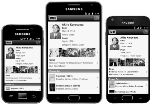
Figure 2: The mobile phones used in the experiment, running IMDB. From left to right Samsung™: a) Galaxy Ace, b) Galaxy Note, and c) Galaxy SII.

In order to investigate these hypotheses we adopted a between-groups experimental design [19] where we asked three groups of users to interact with the same application on three different devices and then formulate their view about it (each group interacted with one device).