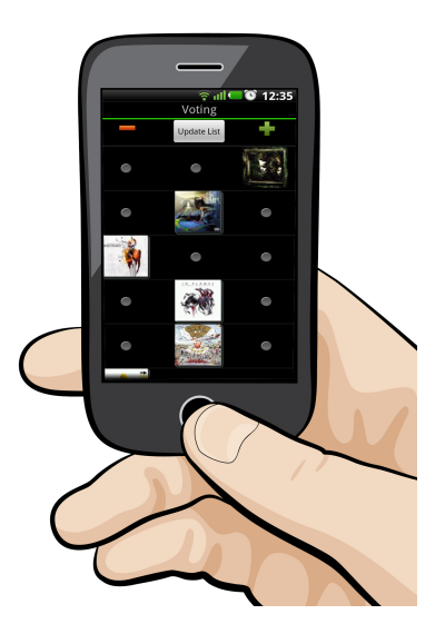
Figure 3: Voting is done from a list of the current nominations.

An important concept characteristic is that no person can single handedly decide what songs to hear, hence another primary functionality is to vote for nominated songs. Like the nominating functionality, voting is done using the handheld devices. The interface presents users to a list of the nominations where they can vote for each nomination (see Figure 3). A plus or minus vote will simply add or subtract one point from a total score respectively and the song with the highest score will be played next. Additional elimination rules are implemented and are enforced at the end of each song, to make the system more dynamic. The first rule removes nominations with a negative total score. The second rule removes nominations that have not received votes (positive or negative) after three songs.