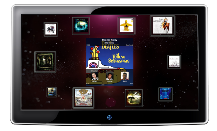
Figure 2: The situated display depicts the current state of the system.

The user interface of MEET is distributed across several devices and thereby to several users. The situated display serves as the only common output device for the player and although it does have an additional part of the user interface on a small screen, this is primarily used for connecting users to the system. All input happens through the handheld devices. Output concerning individual actions, such as keeping track of personal nominations and votes, is provided directly on the handheld device and the current state of the system is summed up on the situated display (see Figure 2).