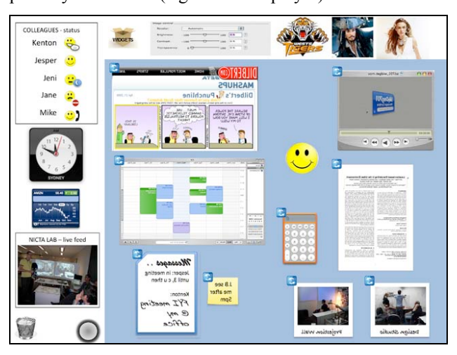
Figure 4. Example FrostWall - viewed from inside an office with some elements mirrored for readablity from corridor.

As an example of a customised widget for the project, we designed a status list for the activity of colleagues (e.g. out of office, do not disturb, on the phone, etc) to be put in the private (inwards facing) area of the display. Another widget shows a live video feed from a remote collaborator's lab. From the corridor-side colleagues can flip all elements placed in the publicly visible area of the display to face outwards for legibility. They can leave messages on the wall by writing with an electronic pen, typing on a virtual keyboard, or by sending an SMS from their mobile phone to a number specified on the display. Finally, they can browse the content displayed (e.g. the calendar) and operate the widgets set by the owner to be publicly interactive (e.g. the video player).