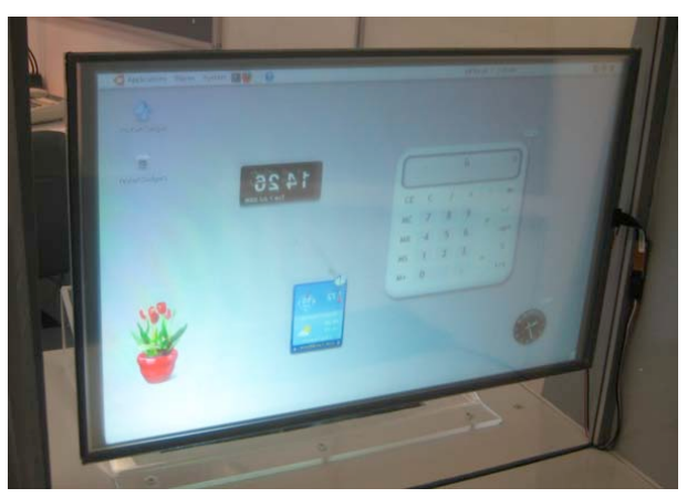
Figure 5. FrostWall prototype system using Compiz

We have built a functional prototype of the FrostWall concept to allow further research into interaction design and use of dual-sided graphical interfaces and to facilitate user studies of the FrostWall situated display. On the hardware side our first prototype offers a dual-sided interface projected onto a sheet of Plexiglas with an area of 22" covered by MirrorVu semi-translucent projection film (using a half silvered mirror technology). On both sides of the Plexiglas are mounted a 22" capacitive touch screen providing two separate single-touch inputs.