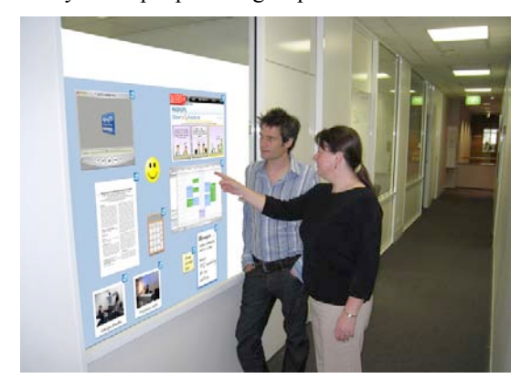
Figure 1. FrostWall set-up in an office corridor

The value of a situated display is determined by the relationship between the relevance of the information displayed to the behavioural context of the place in which it is located (O'Hara et al., 2003). At the same time, situating displays in context allows information to be provided "just in place" (Kjeldskov, 2002) and in a way that can be read and interpreted indexically. In the case of situated displays in the workplace, this means that the content and interaction design have to fit the specific areas of the workplace in which they are located, and that implicit meaning adding to the explicit content displayed can be drawn from this placement. For example, if situating a display in a corridor space, the content should fit the more informal and ad-hoc parts of collaboration and the serendipitous interactions that typically take place here. If situating displays in close physical relation to individual's offices or shared workspaces, it will be implied that the information displayed is related to and owned by those people and groups.