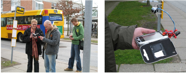
Figure 5. Field evaluation of Buster with wireless camera attached to the mobile device (right)

simplicity, positioning and active context-awareness was simulated using the 'Wizard of Oz' technique [e.g. 5].