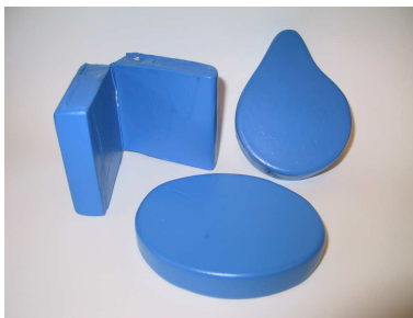
Figure 2. Device props used in acting-out sessions

The design process of Buster was initiated through a series of acting-out sessions with prospective users [4] following the contextual interviews. The acting-out sessions took place on busses en route through the city of Aalborg, Denmark and involved 4 participants enacting future use of a mobile device represented as a non-functional prop (figure 1). Following a short introduction to the process of acting-out and the purpose of the props, the participants were accompanied on a bus journey, during which they used and explained imaginary functions and information of a mobile information system. Two researchers supported the acting-out sessions. One researcher helped the participants explicate the information and functionality that they imagined that the device would offer, and how they would interact with it. The other researcher recorded the sessions on video.