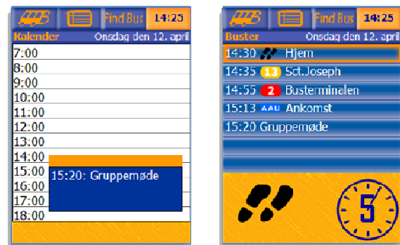
Figure 4. Functional prototype screens of Buster

The final paper prototype design was implemented as a functional prototype (figure 4). Apart from a few adjustments, the functional prototype matched the description above. As a major graphical adjustment, the colour scheme of the functional prototype was modified to match the cooperate look of the bus company's printed timetables and their website.