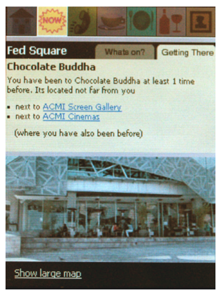
Figure 9. Now screen: way-finding instructions based on history of visits

The field studies also revealed that people seldom navigate by means of detailed maps and route descriptions when making their way around a built environment such as Federation Square as a part of a social group out on the town. Neither do they need or want to. Instead they make use of indexes to familiar places and landmarks in their surroundings. This finding was used to inform the design of the "Getting There" tab in Just-for-Us (figure 9).