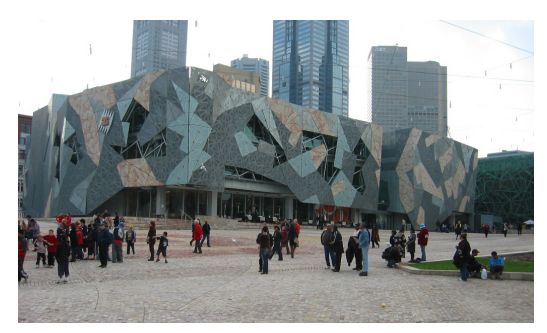
Figure 1. Federation Square, Melbourne, Australia

In the first study, methods were adapted from Urban Planner Kevin Lynch [18] and Architect Christopher Alexander [1]. Lynch and Alexander both modelled built environments, specifically cities,