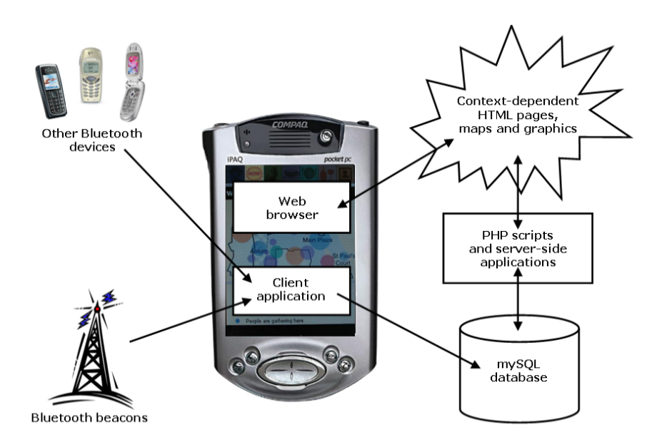
Figure 3. Just-for-Us prototype system architecture

The web interface of Just-for-Us was implemented using PHP for server-side generation of HTML pages on an Apache web server on the basis of the content and context information in the mySQL