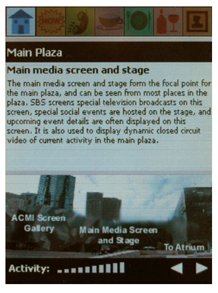
Figure 4. Home screen: augmentation of the user's built surroundings

displaying information corresponding to the district where the user is presently located (figure 4).