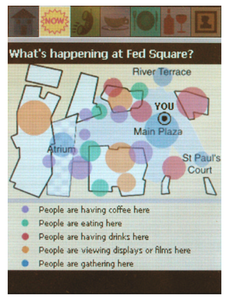
Figure 7. Now screen: showing clustering and activities of close-by people

When the user clicks on the "now" icon on the main menu bar, the system displays a small map of the user's immediate surroundings with superimposed, dynamically updated, coloured circles indicating the clustering and activities of people within proximity (figure 7).