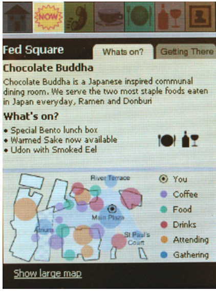
Figure 8. Now screen: details about selected place and small activity map

server on the basis of the context information in the mySQL database.