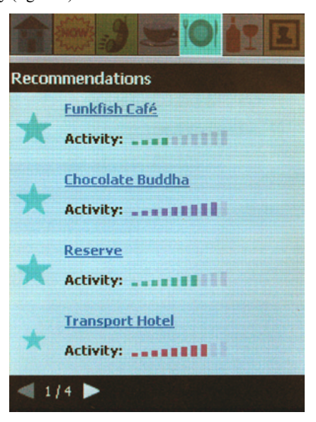
Figure 6. Recommendations screen: ranked list of places to go for food

Another finding from the empirical studies, which had impact on the design of Just-for-Us, was that places and spaces are dynamic and that setting matters immensely for the quality of socializing especially in relation to its physicality, the presence and activities of other people and its convenience in terms of closeness. It was notable that people like to go back to places they know well, have been to before with friends in their current social group, or that have been recommended by a friend. People seldom go to completely new places if a familiar place exists within convenient distance. On the basis of these findings, Just-for-Us attempts to support the ongoing negotiation of where to go by indexing to the social group's shared knowledge of familiar places and providing information for the group to be able to size-up the situation before committing to entering a place. When the user clicks on one of the four activityicons at the top of the screen (coffee, food, drinks or cultural events), the system presents a list of recommendations of providing this activity (figure 6).