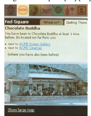
Figure 4. Just-for-Us: Indexical way-finding instructions based on physical context and history of visits

Our most recent indexical prototype system is a context-aware mobile web site, Just-for-Us, facilitating sociality in the city of Melbourne, Australia by providing the user with a simplified digital layer of information about people, places and activities within proximity adapted to users' physical and social context and their history of social interactions in the city (figure 4). In this prototype, indexicality was, amongst others, used to 1) create strong links between the information in the system and the real world surrounding the user, 2) reducing the information needed when presenting specific content (such as recommendations) to a group of users, and 3) generating easy-to-use way-finding descriptions referring to the group of user's familiar places, and thus exploiting their existing knowledge about a space [14] [17].