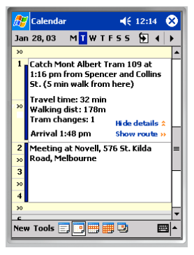
Figure 2. TramMate: route-planning information for public transport indexed to location and scheduled activities

TramMate (figure 2) is a context-aware mobile information service providing users with a route-planning tool for the tram based public transport system of Melbourne, Australia. It was specifically targeted at business employees who, during a typical workday, have to attend appointments at different physical locations. The fundamental design philosophy behind the interface design of TramMate was to minimize information displayed to the user by indexing to the contextual factors, which the system was aware of, such as location, objects (trams), upcoming appointments etc. TramMate does this by keeping track of contextual factors such as the user's physical location, upcoming appointments and real time travel information. The design is integrated with an electronic calendar and alerts the users when they should commence their journey [11].