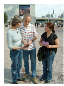
Figure 5. Field evaluation of the indexical context-aware mobile web site Just-for-Us