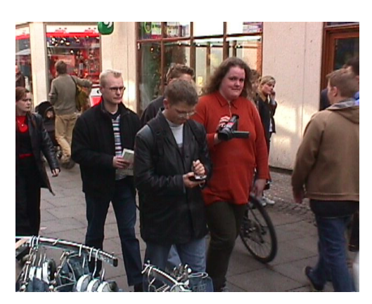
Figure 4. Usability test session in the pedestrian street

We designed the pedestrian technique to include systematic data collection. All tests in the pedestrian street were video recorded using a video camcorder as shown in figure 4 below.