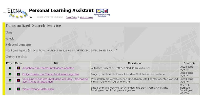
Fig. 2. A prototype for personalised search results user interface.

The personal recommendation (based on learner personal profile) is depicted in the first column (PReco). There is a second column (Reco), which provides learner with group based recommendation. Such group-based recommendation is calculated according to recommendations of learners from the same group who are using the same personal learning assistant.