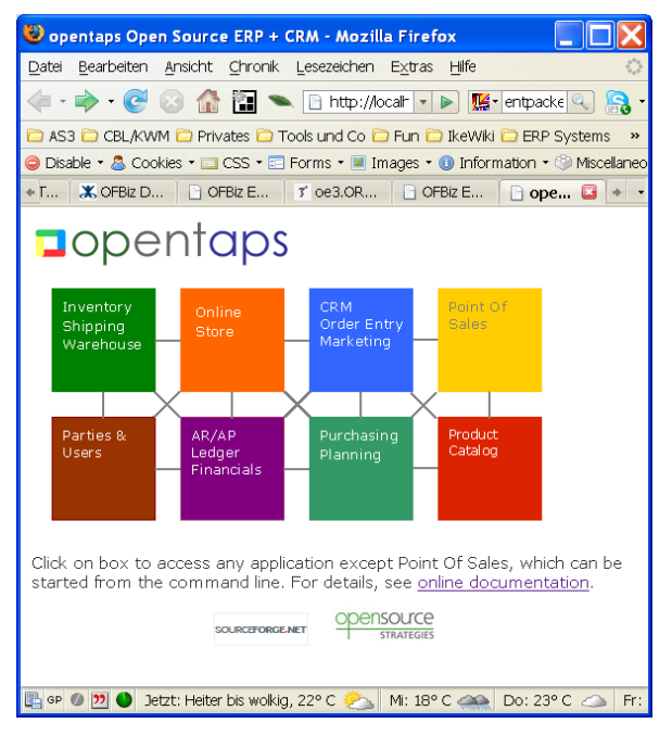
Figure 1, OFBiz start screen on http://localhost:8080

As mentioned before, OFBiz comes with embedded servers and databases, so running OFBiz is very simple. Just click on the startofbiz.bat file in the opentaps directory or use your command tool window and navigate to your opentaps directory and type in startofbiz.bat. It may be necessary to change this file, so that the java keyword is found. At least java -jar ofbiz.jar must be called. Better call java -jar ofbiz.jar > runtime/logs/console.log, so that console output is written into a log file (as in the starofbiz.bat file). The start process may last some minutes, because applications and add-ons are dynamically loaded into OFBiz and database tables, services, forms, ... are generated on the first build. When the build process is ready, you can visit the application at http://localhost:8080 in your favorite web browser and you will - hopefully - see the application as in Figure 1.