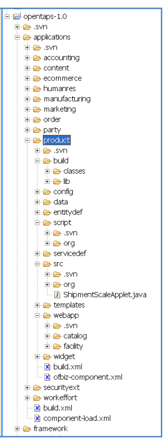
Figure 3, Folder structure of an application

The file build.xml tells the framework how to build an application and can be compared with a Java makefile.